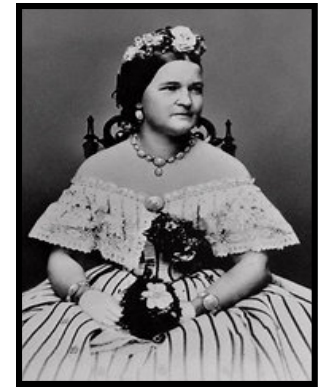
Mary Todd Lincoln, Best Dressed Class of 1861?